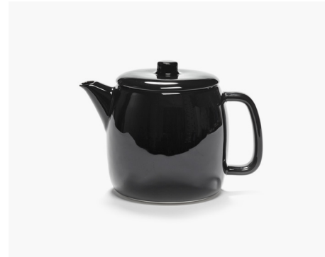
Vincent Van Duysen