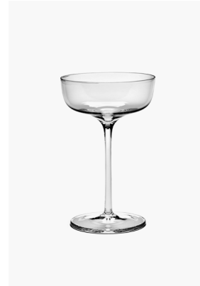
Vincent Van Duysen