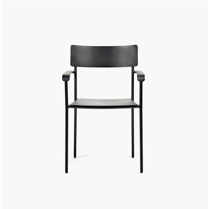
August chair by Vincent Van Duysen