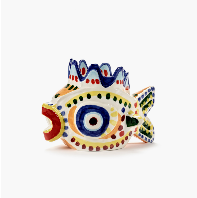
Sicily vase by Ottolenghi & Ivo Bisignano