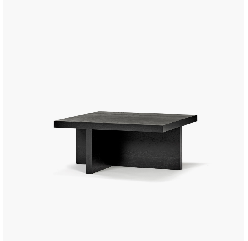
Rudolph coffee table by Vincent Van Duysen