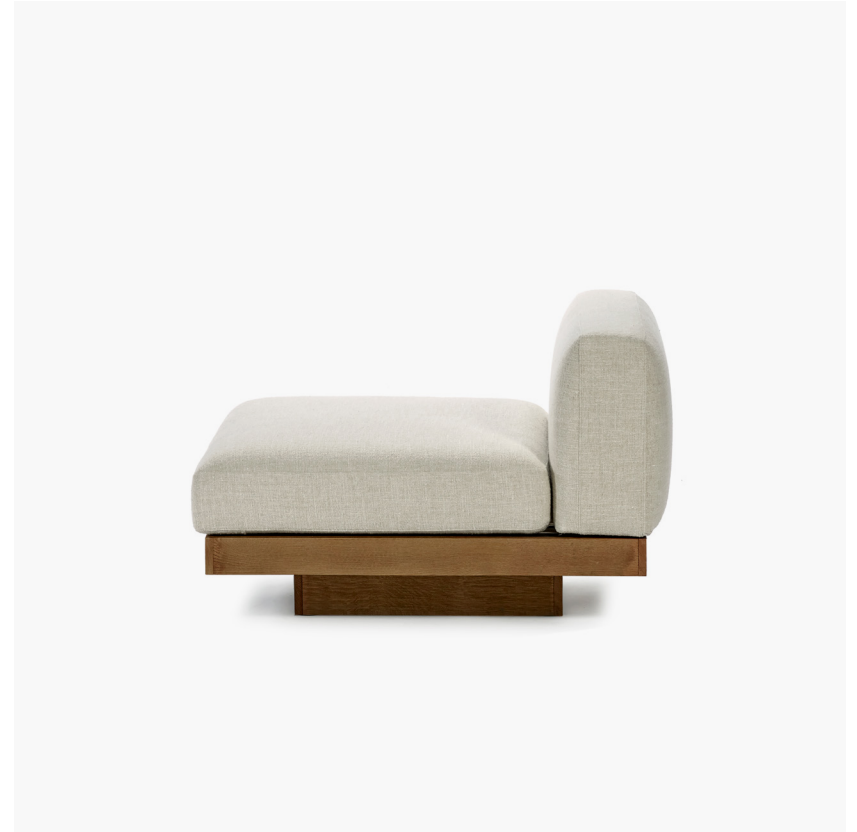
Rudolph one-seater by Vincent Van Duysen